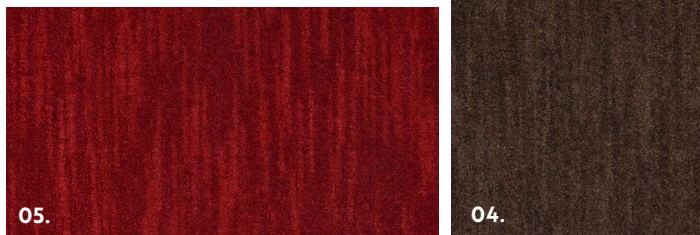
01. Dark Grey 02. Charcoal Black 03. Navy Blue 04. Taupe 05. Red