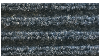
04. Slate Blue