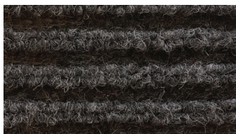
02. Dark Grey