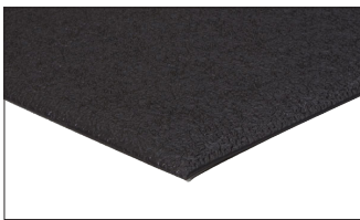
01. Solid Black Pebble

Your workers are your most important assets; keeping them safe and comfortable increases productivity and reduces safety and injury risks. Comfort Step's 3/8" thick vinyl construction provides a soft yet resilient surface designed to reduce standing pressure on joints, allowing workers to stand comfortably for longer. Fire and chemical resistant, Comfort Step is the high-performance anti-fatigue matting solution for the most demanding industrial environments.