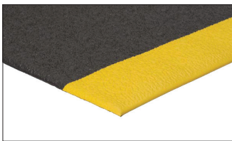
03. Black w/ Yellow Border Pebble