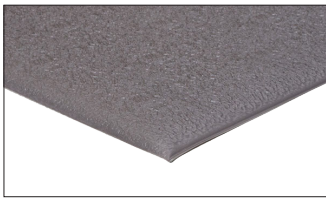
05. Grey Pebble