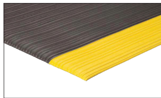
04. Black w/ Yellow Border Ribbed