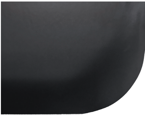
01. Solid Black

Luxury Step's smooth matte wear layer is puncture resistant and easy to clean, while the expanded foam sponge reduces stress on legs and joints for added comfort and performance. Its beveled edges reduce trip, slip and fall accidents, and its moisture-resistant engineering make it suitable for most any environment.