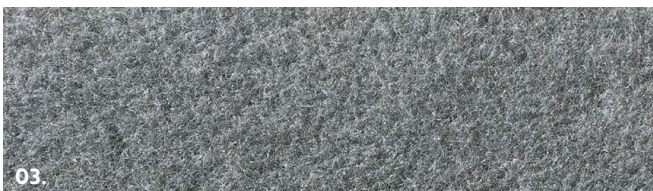
01. Natural SYN0111 02. Black SNY0211 03. Grey SYN0311