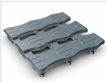
01. Light Grey