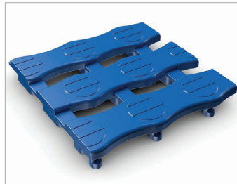
04. Ocean Blue