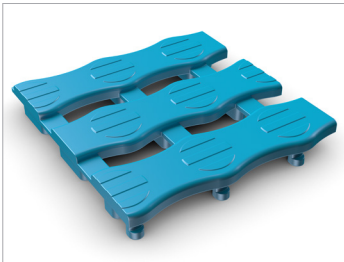
03. Light Blue