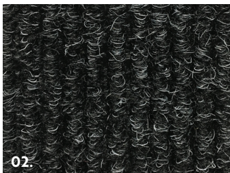
01. Sterling 2344 02. Charcoal 1198 03. Black Shadow 2343