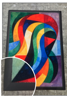
ADA compliant medium profile edging