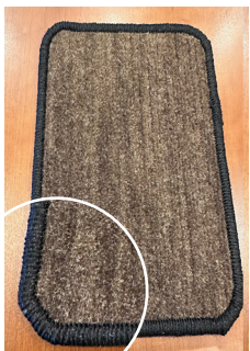
Surged Border - rounded corners only